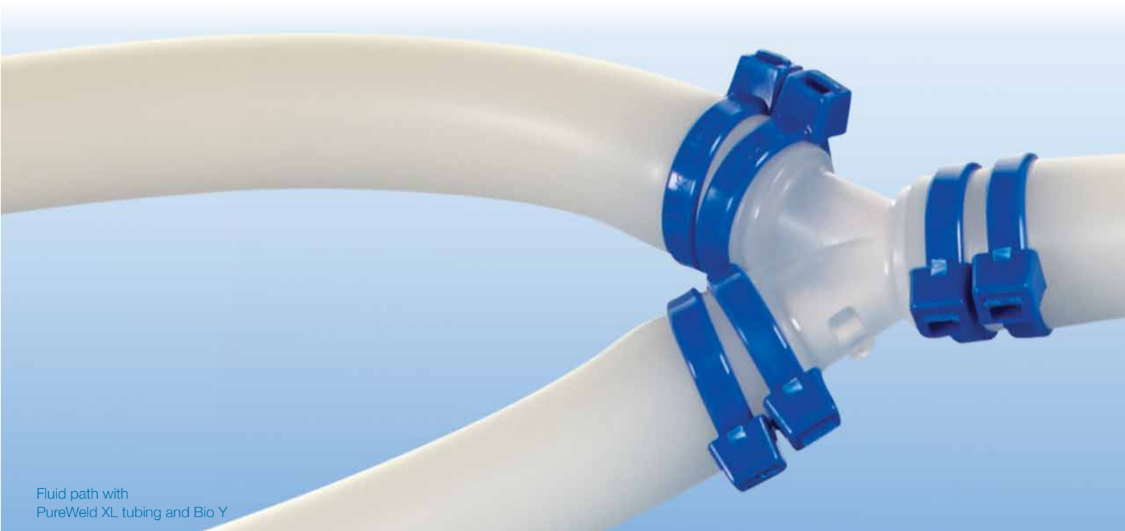
Fluid path with PureWeld XL tubing and Bio Y